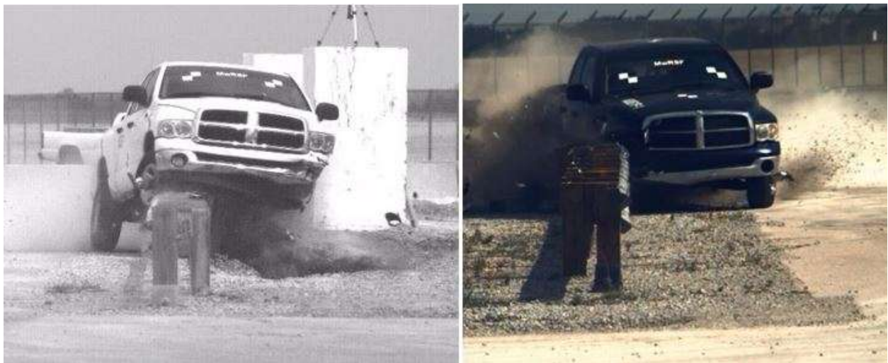
Comparison of W-beam (left) and MGS in a MASH Crash Test