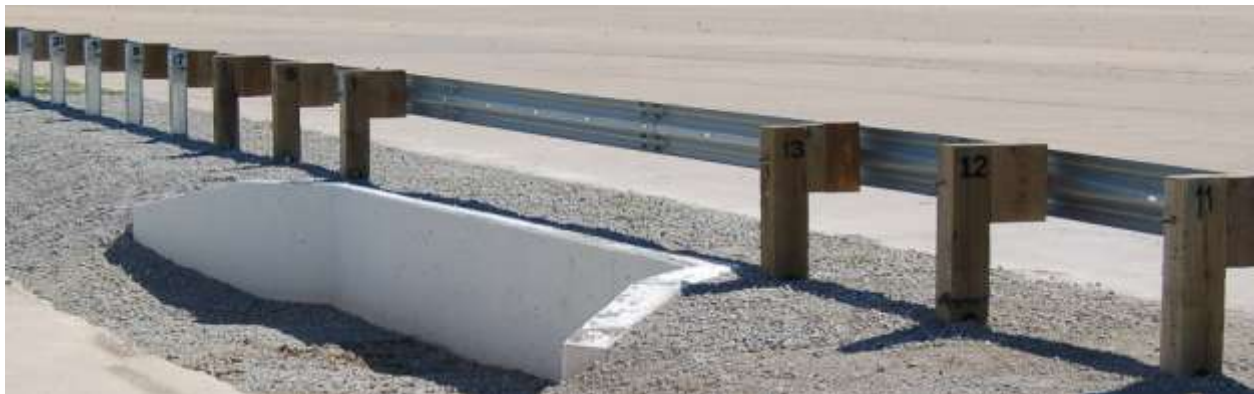
The Pooled Fund Seeks to Expand the Length of the Free Span of the MGS Long Span

2. Extension of the MGS Long Span for Box Culverts. Currently, the Pooled Fund has a design for MGS spanning 24 feet (without posts). This is typically used for box culverts with little cover and where guardrail posts cannot get their full embedment depth. The Pooled Fund members saw a need to omit one more post to account for the typical width of most box culverts. The first crash tests have gone well and MwRSF should be conducting the final two tests in the near future.