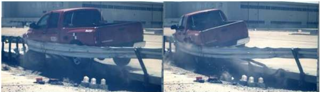
The MGS Bridge Rail Performed Quite Well in High Speed Redirection Crash Tests.

This system is currently being constructed on a box culvert over St. Mary's Creek in District I, where the existing railing is substandard, and there was not enough fill to embed guardrail posts over the top of the box.