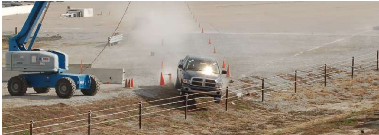
Early Testing of the MGS High Tension, Non-Proprietary Cable Guardrail

system on median slopes. No criteria had ever been established for crash testing in conjunction with median slopes. Researchers had to analyze the various trajectories and bumper heights for various vehicles as they depart the roadway, traverse the median and cross the ditch. The test matrix has now been resolved and will be added to the forthcoming update to MASH (Manual for Assessing Safety Hardware). Other problems have delayed this project as well, but it is now on track and hopefully will result in an approved system. A terminal for this system is also in the developmental stages.